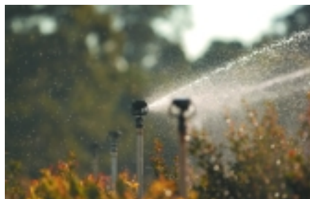
The Rain Bird LF1200 in action at Downes Nursery.

The system will be used in conjunction with Rain Bird LF1200 sprinklers which are designed for high uniformity so all container pots are evenly wetted.